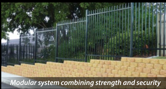
Modular system combining strength and security