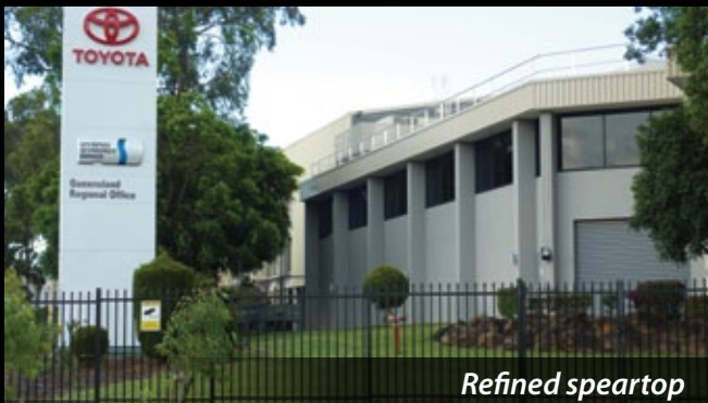
Refined spear top